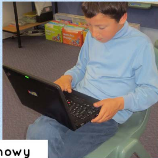
Snowy Hydro speech writing