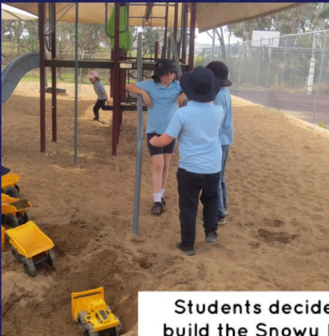
Students decided to build the Snowy Hydro in the sandpit