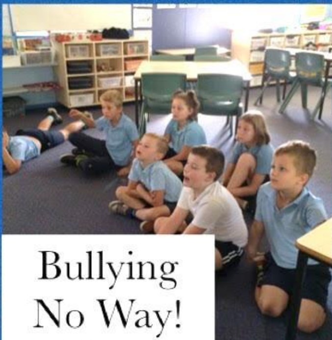
Bullying No Way!