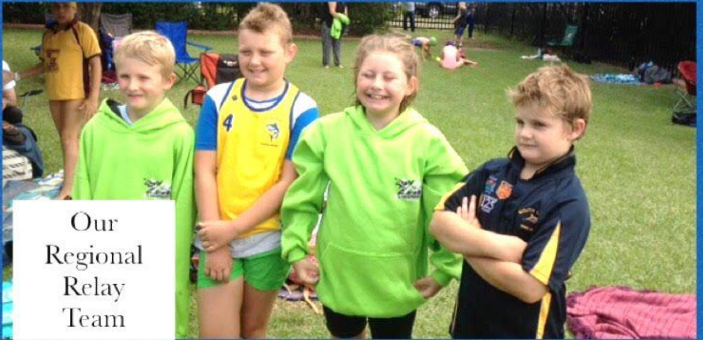
Our Regional Relay Team