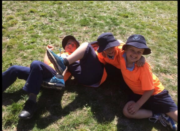
Tee Ball @ Binalong Dalton Park