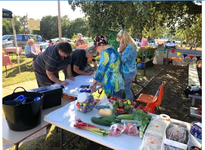
Busy at the raffle ticket table.