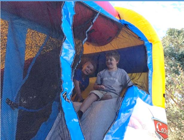
You can run but you can't... wait! You can't hide but you can slide!