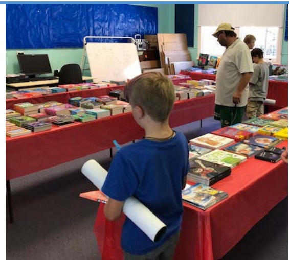
Busy book fair inside and outside.