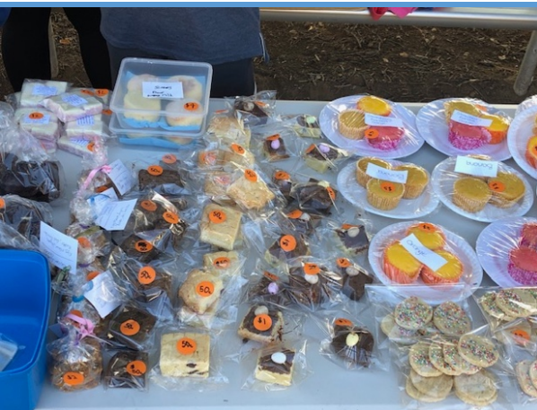
Food! Glorious Food!