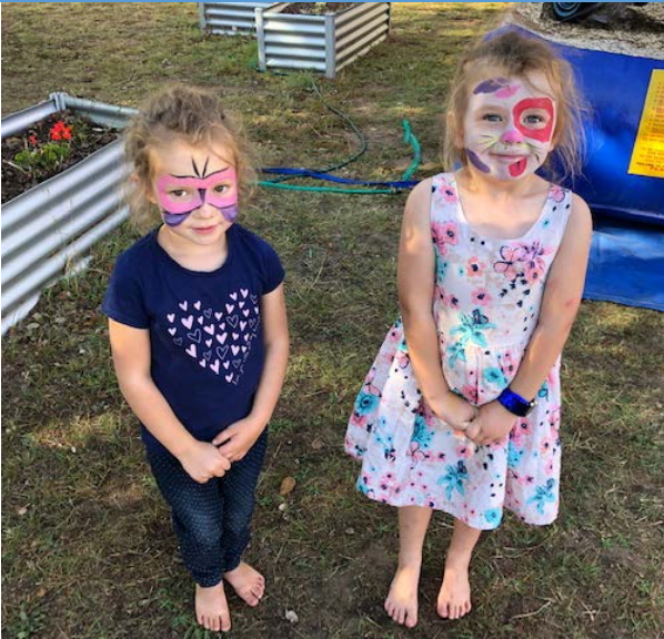
I wonder who this beautiful butterfly and pretty puppy could be?