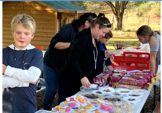
Some familiar faces called in as well.